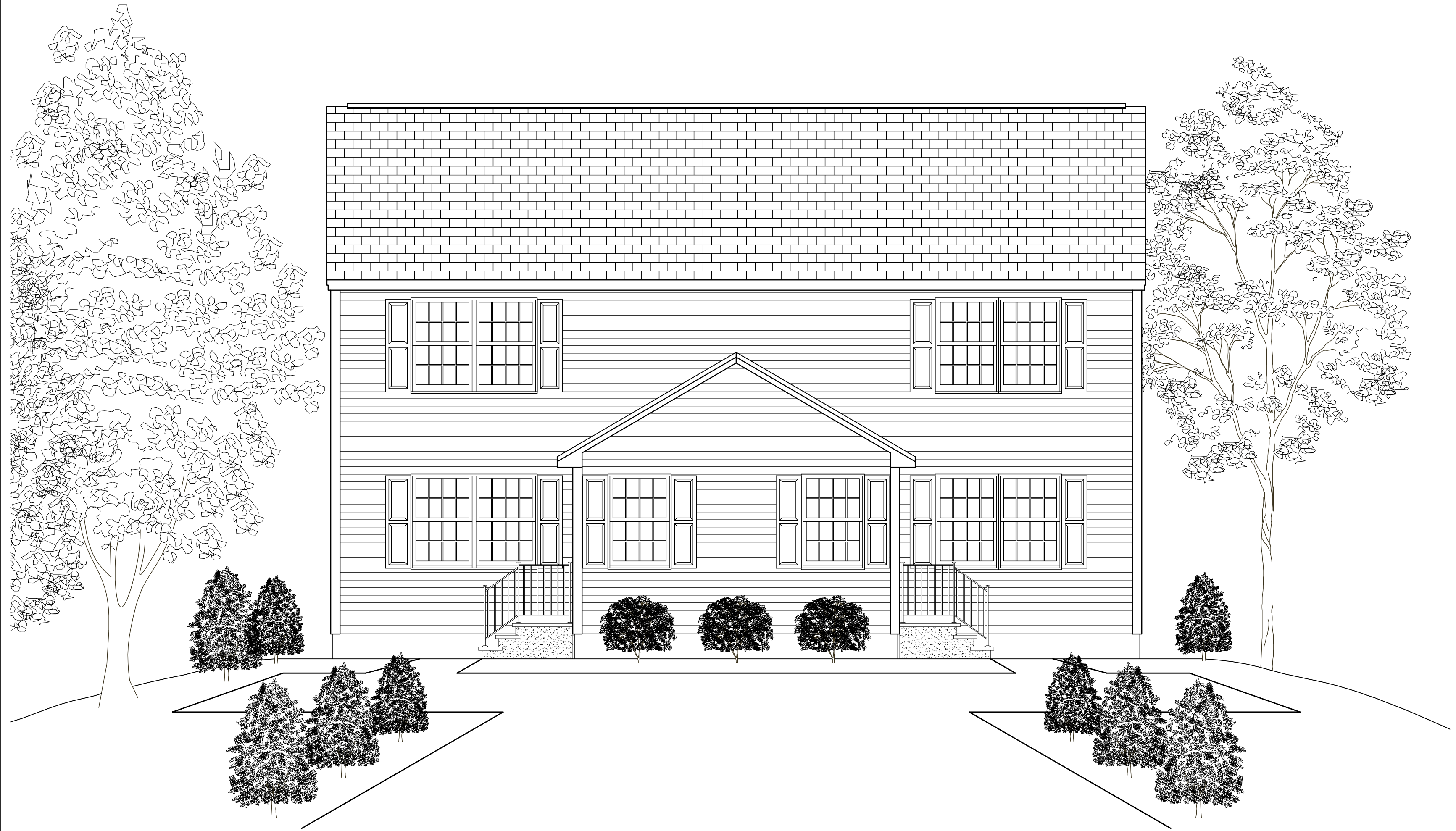
1 ELEVATION-FRONT Scale: 1:1