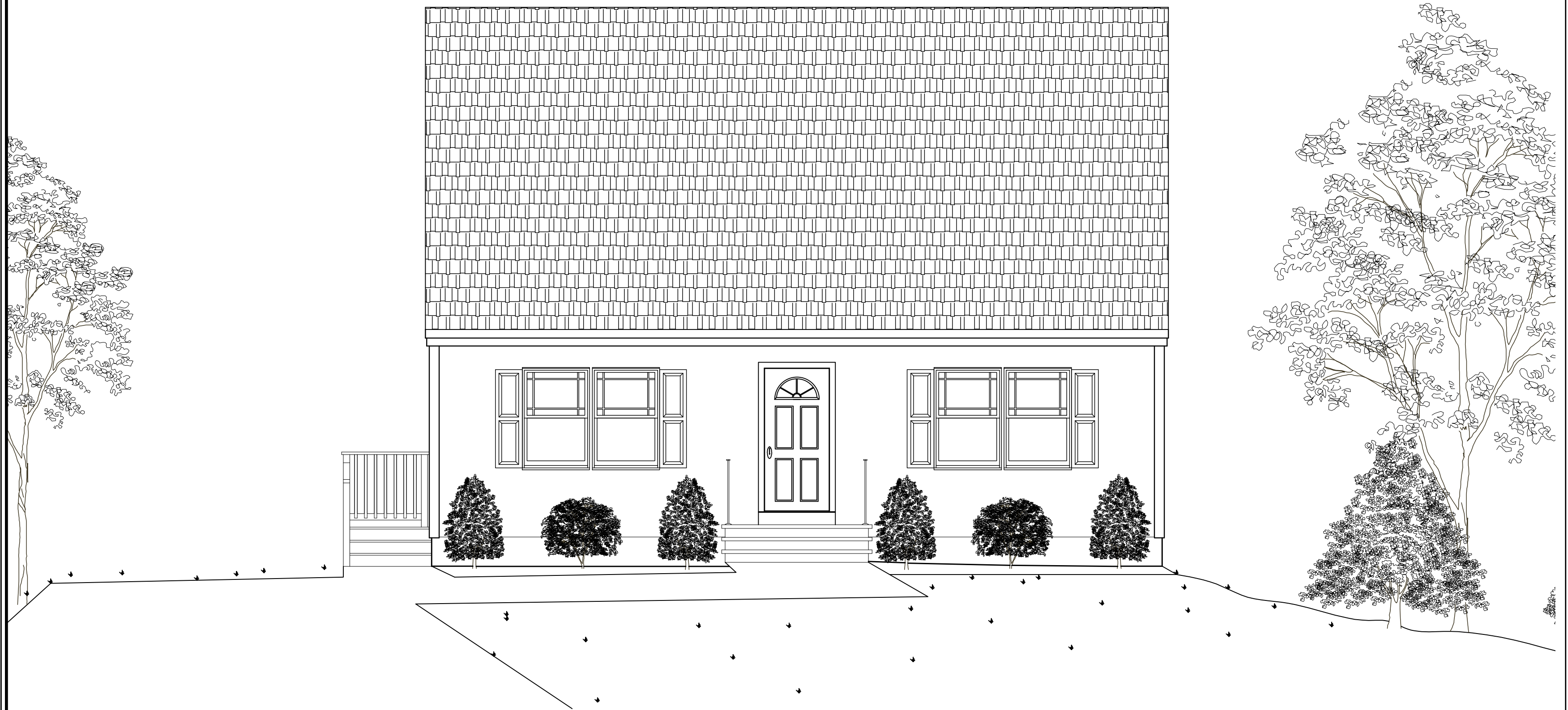
1 ELE-Front Scale: 1:1